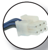
(1) M/B (CPU)